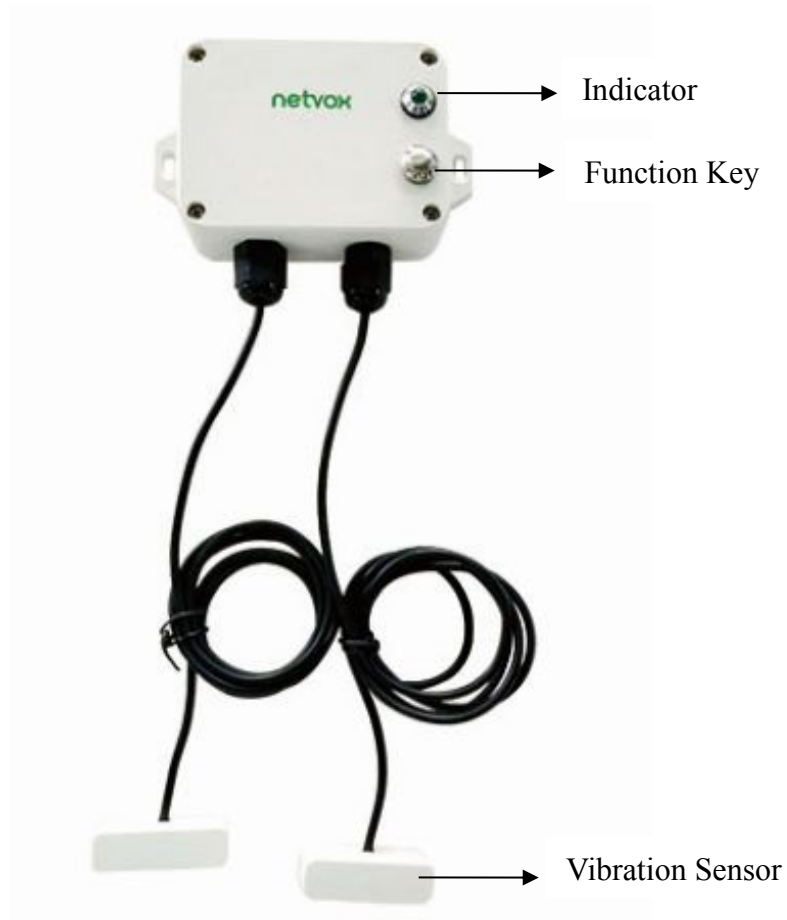
Fig.1 R718DA2 Appearance