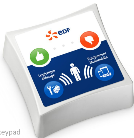
Example of customized keypad